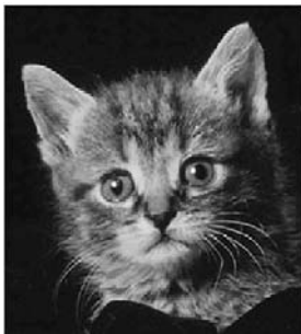
Fig. 1. Original image prior to edge-preserving smoothing, taken from reference [9].

For illustration, Figure 2 demonstrates two different ways of performing edge-preserving smoothing on the original image in Figure 1. The result of using nonlinear diffusion filtering and the result of bilateral filtering is similar but not identical, since the parameters are different and it was intentionally chosen to use a large window size with the bilateral filter and several iterations with anisotropic diffusion. That is the most natural setup for the two to be used. In some applications, such as the ones described in [10], notions from the nonlinear diffusion equation are borrowed by using several iterations along with a small window size. For such applications it is clear that a single iteration with a large window size is not adequate and a feedback mechanism is needed. However, in other applications where it is not necessary to closely imitate a diffusion process, for the sake of economical computation it is possible with one iteration using an extended neighborhood to perform an edge-preserving smoothing that perceives even better. In the specific example that was chosen, one can notice the advantage of using a large window size that enables preservation of thin elongated structures such as the whiskers emerging in Figure 2.